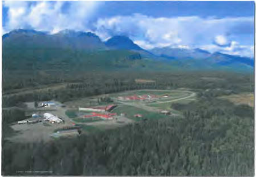
Palmer Correctional Center

The Palmer Correctional Center, located within the Sutton planning boundary, is now, and has consistently been, proposed for expansion by the Alaska Department of Corrections because it is the least costly